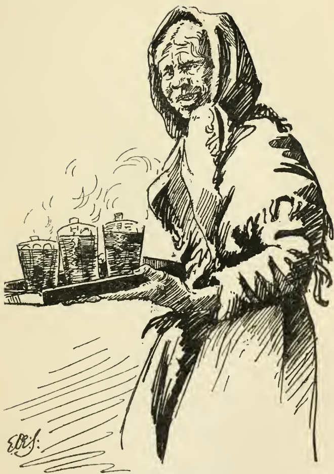
"THE GREY-HAIRED KITCHEN-MAID."